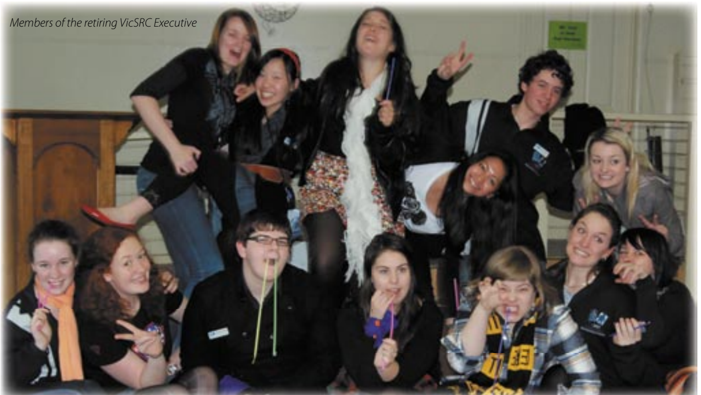
Members of the retiring VicSRC Executive